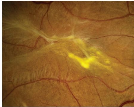
Figure 2 Epiretinal Membrane

Surgery for ERM has a good success rate, and most patients experience improved visual acuity and decreased metamorphopsia following vitrectomy. ●