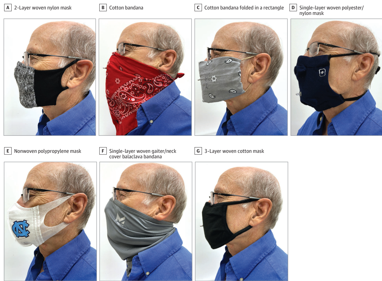
Figure 1. Consumer-Grade Masks and Improvised Face Coverings

The face coverings tested in this study included a 2-layer woven nylon mask with ear loops (54% recycled nylon, 43% nylon, 3% spandex), tested with and without an optional aluminum nose bridge and nonwoven filter insert in place (A), a cotton bandana folded diagonally once “bandit” style (B), a cotton bandana folded in a multilayer rectangle according to the instructions