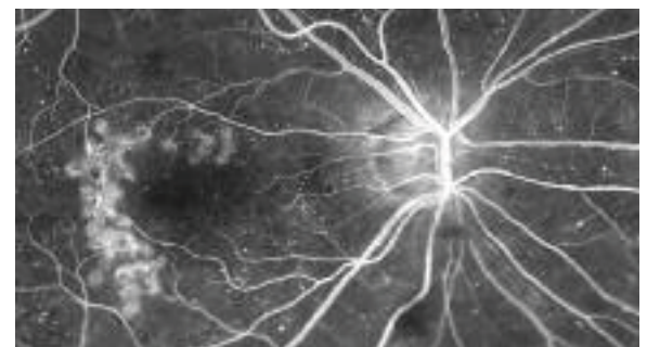
Magnifying the same optomap® fa image provides a detailed view of the previously treated CSME and microaneurysms.