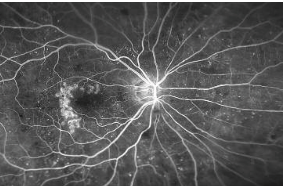
optomap® fa image. Previously treated CSME, microaneurysms and peripheral hemorrhages can be clearly seen.

Ultra-widefield fluorescein angiography aids in the simultaneous assessment of macular and peripheral retinal circulation in retinovascular condition, allowing us to more precisely classify subtypes of these conditions and guide our therapies.