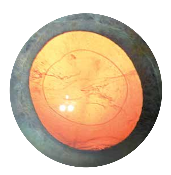
Cataract surgery: SCI enables you to recognize the slightest tissue residue in detail.