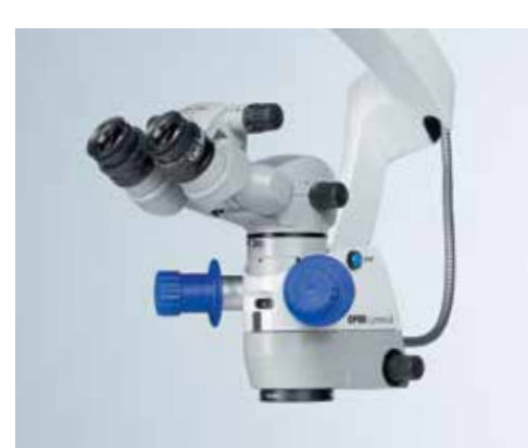
MEDIALINK 100 7FISS RESIGHT 500 Invertertube