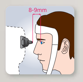
The safety distance can be manually adjusted very quickly and easily. Each patient and each eye needs to be adjusted before measurement.

The CT-1/1P incorporates new safety functions which have been designed in a fully automated style. The instrument features an innovative safety function to keep the preset distance (ex.8-9mm) manually between the cornea and the nozzle, in addition to the "TOO CLOSE" notification on the screen and a buzzer alert if the cornea and the instrument are too close.