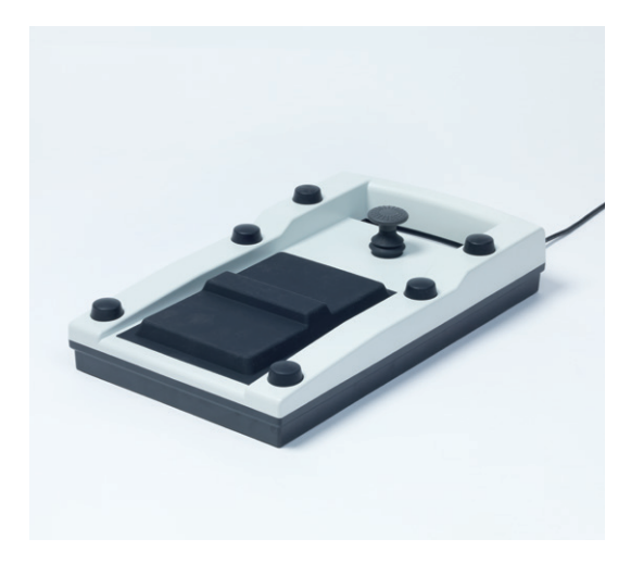
Ergonomic foot panel

And with OPTIME service packages from ZEISS extending from preventive to corrective maintenance, as well as spare parts, you can count on maximum system uptime and convenience.